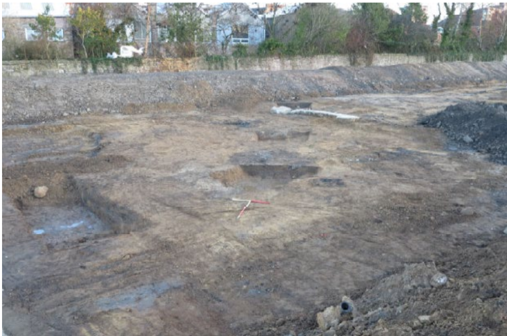
Excavation of large 16 th ditch by AOC Archaeology thought to be part of the siege works of the Protestant Armies during the Siege of Leith in 1559-60.

Prior to the redevelopment of the site for housing the site of the former late 19 th century Tay Engineering works was excavated by AOC Archaeology Group. As well as recording the surviving industrial buildings prior to their demolition the site was excavated to record evidence of the former Georgian country House known revealed in earlier work. The excavations revealed a complete footprint for this important house and for its use and development. However, excavation significantly revealed a large curving ditch (see photo below) containing fragments of 15 th -17 th century pottery. Initial research would indicate that this ditch formed part of the besieging works undertaken during the 1559-60 Siege of Leith as depicted on the 1560 Petworth Map of the Siege.