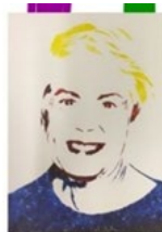
Annette Crossie (former BHS pupil) Actress