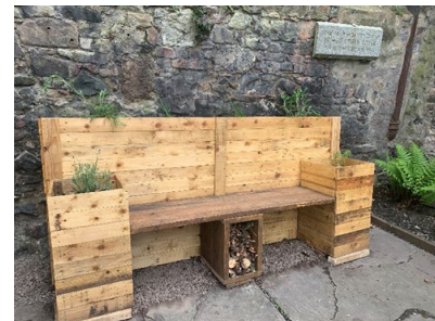
The museum's new carbon capture education bench. Made from reclaimed pallet boards, it has planters at the back and sides and an insect hotel underneath.