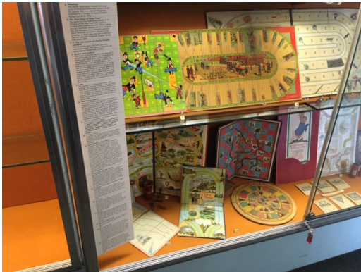
The old case lining

the doll's house and toy vehicles gallery. Staff are currently working on a funding application for Museums Galleries Scotland to go towards more fresh new fabric for these galleries. We are looking forward to welcoming back visitors young and old as soon as possible.