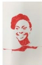
Chimamanda Ngozi Adichie Author