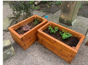
Some of the new planters made by the Community Payback team

Funding from Museums Galleries Scotland has also allowed us to make the space more environmentally friendly by adding a mixture of new plants and herbs to the space, putting biochar in the soil to store more carbon in the ground, and adding new seating made from reclaimed wood. New signage in the courtyard explains the changes that have been made and how they help the environment.