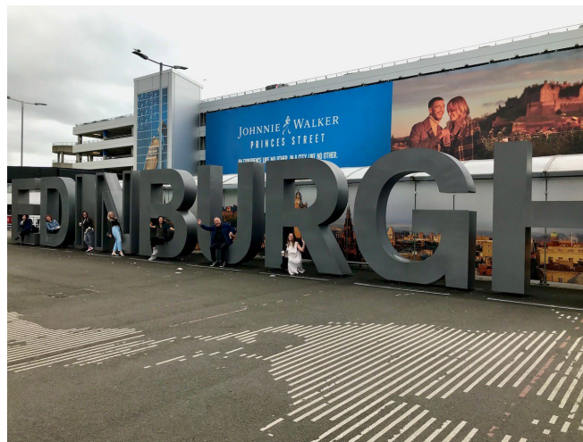
Hosting of Network Event in June

In addition to drama productions, the city has hosted over 30 factual TV shoots so far this year including: Songs of Praise at Canongate Kirk, Antiques Road Trip, Trials that Shocked Scotland, a BBC Bitesize Geography on tourism (filmed in the Pentlands and on Princes Street and the Royal Mile), Dancing on Ice, Britain's Got Talent 2022, a new Darren McGarvey series on additions, Hobby Man (a new take on Travel Man), 'The Fringe in 12 Jokes' celebrating 75 years of the Fringe, Scotland the New Wild, series 3 of Cold Cases, Location Location Location which provides an hour's free on-screen prime time promotion of the city, Landward, Mary Berry's Cooking and Sharing which filmed at the Edinburgh Marathon, and a number of international documentaries about Edinburgh's history and culture.