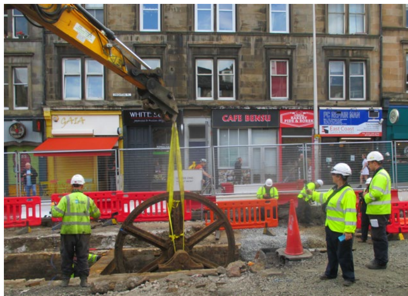
Removal of one of the two 1888 Tram Cable wheels which formed the terminus of the Edinburgh Tram until 1924 line at Pilrig Street Junction Leith Walk and part of the 'Pilrig Muddle'.

In August 2020 the discovery was made of the terminus cable winding mechanism of the 1888-1924 Edinburgh Tram Cable system at the Junction of Leith Walk and Pilrig Street at boundary of the then Council areas of Edinburgh and Leith. These remarkable feats of Victorian Engineering were decommissioned in 1924 when Edinburgh and Leith Tram lines were joined together with Edinburgh becoming electrified. Up until this point passengers had to dismount at this location as Leith was electrified earlier. This became known as the 'Pilrig Muddle'. These important pieces of Industrial heritage have been retained and conserved with the hope that they will be re-erected close to their original location.