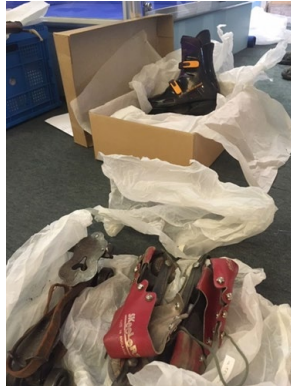
Selecting new objects