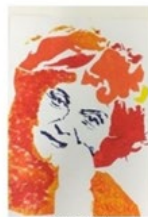
Muriel Spark Author