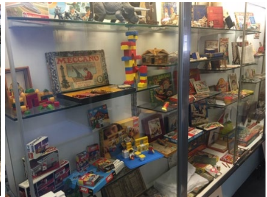
New Displays in Progress