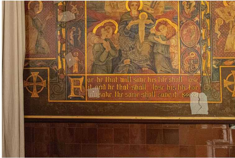
Image of part of the Phoebe Traquair murals decorating the former mortuary Chapel of the Royals Sick Kids Hospital at start of conservation.