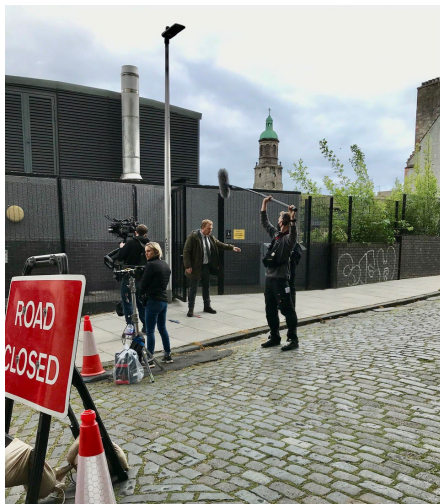
Filming of Six Four