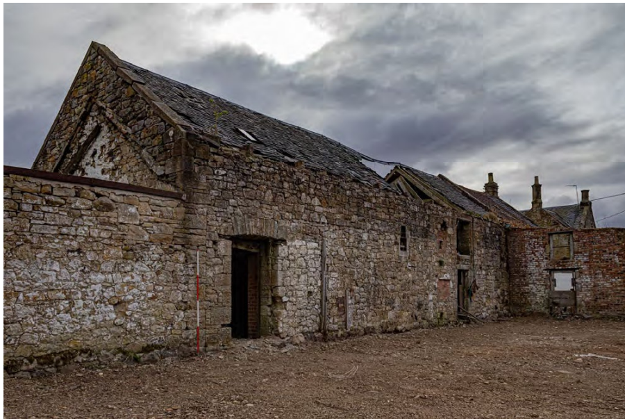
Main East range of 18 th century Whitemoss Steading prior to conversion.

Prior to its conversion into new housing a detailed historic building survived was undertaken AOC Archaeology Group. This survey provided detailed evidence for the construction and development of this historic steading from its construction in the mid-18th century possibly from an earlier farm into a courtyarded steading, with a threshing barn and horse gin to the south-west side and a cow byre to the northeast, through to the 20 th century. In the later 19 th century, a farmhouse was constructed to the south-east of the steading and the horse-gin was replaced, probably by a small steam engine, to power the threshing machinery.