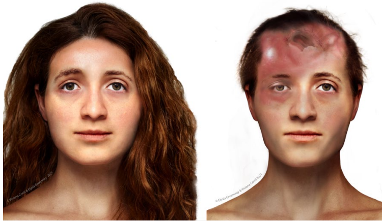
Facial reconstructions by Viviana Conti and Elysia Greenway of 15 th century woman (SK232) featured on BBC2 Digging for Britain.

(fragments) is undertaken. Together with the similar number from the 2008 excavations, these remains constitute one of the largest excavated assemblages of medieval inhabitants of not only Edinburgh but also Scotland. The ongoing research and interest in the study of these which are proving to be of National archaeological importance has generated significant public interest. In addition to our projects archaeological YouTube Vlogs (see Trams to Newhaven website https://www.edinburgh.gov.uk/tramstonewhaven/faqs/project-archaeology ) and undertaking public talks the project was followed by the BBC. The excavations and the remains of a 15 th century woman who survived significant blunt force trauma to the front of her head were featured the key project on the last episode of Digging For Britain shown on BBC 2 in January 2022 ( BBC iPlayer - Digging for Britain - Series 9: Episode 6 )